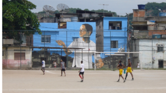
Figure 3: Mural painting with the theme Boy With Kite on the facade in the middle of the slum area of Vila Cruzeiro

aims for artists to collaborate with local youth to create community artworks. The Boy With Kite themed mural is a symbol for the children of the favela . This initial mural was continued by residents who painted cement hillsides with the title Fish Leaping in a River (Darlington 2010). In its development, the Favela Painting project did not last long because the paint faded. This makes maintenance difficult. Furthermore, the community replaced the paint with locally available sustainable materials, namely lime stucco and pigment tiles in the form of a mosaic (Pavela Painting 2018).