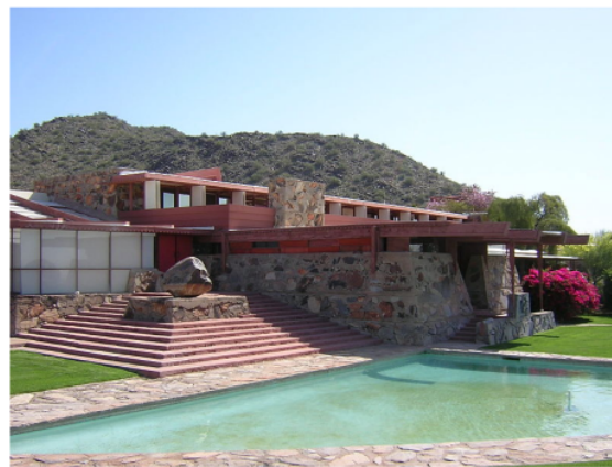
Figure 2: Cherokee red at Taliesin West, Scottsdale/Phoenix Arizona

In architectural art, the art Deco style is demonstrated by the Chrysler Building (1928-1930) designed by William Van Alen. The interior of the luxurious lobby with yellow and orange nuances is designed to follow the rhythm of the greatness of the Egyptian pyramids. Elevator door with lotus motif ornament from brass and wood shows high quality taste (Knowles 2014:115-116). The art Deco style which was influenced by the Dutch artists, is known as the neoplasticism flow. The distinguishing feature of De Stijl's artist is the use of horizontal and vertical lines with primary colors and achromatic colors of white, black, and gray. They put color only on continuous planes without cuts. consistently uses this style in the architectural design of the Schröder House designed by Gerrit Rietveld (Friedman 2007:65).